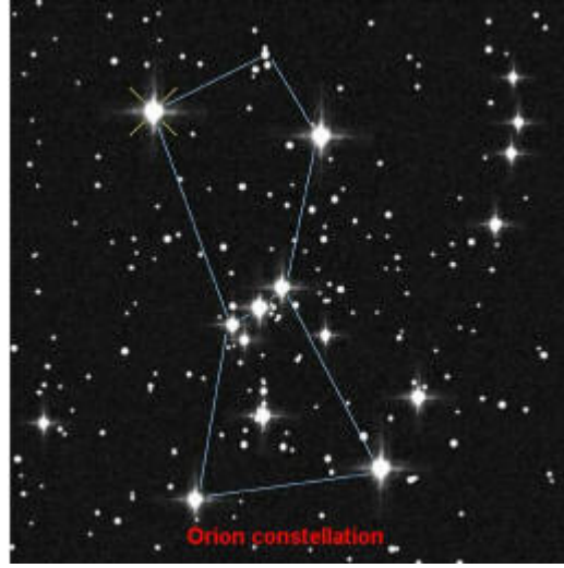
To read further ORION TRANSMISSIONS please check: WWW.oriontransmissions.com

"Again, we would suggest that those of you who are able to, move to communities or create communities where these healing fires are prominent. The effects of these fires will be more pronounced against pollution, mind control-whether it is via mass media or chemicals in the atmosphere-and poisonous foods as a result of both GM production and dangerous chemical additives to soil and plants. You cannot imagine the positive effects these fires produce on body, mind and spirit."