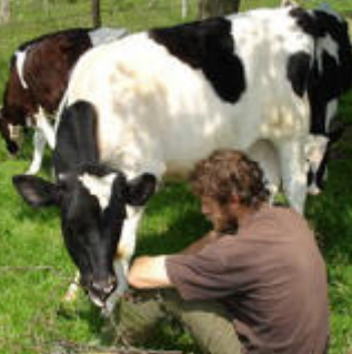
Today the bull is healthy and joyful (with Matthew)

After one month, the calf was breathing more easily and the catarrhal cough was not as severe; after two months the calf demonstrated discomfort only at times the weather changed; three months after the start of Agnihotra Ash treatment the calf began growing and all symptoms improved.