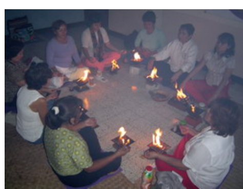
Women 's Healing Circle with the Sacred Homa Fires strengthen the sisterhood.