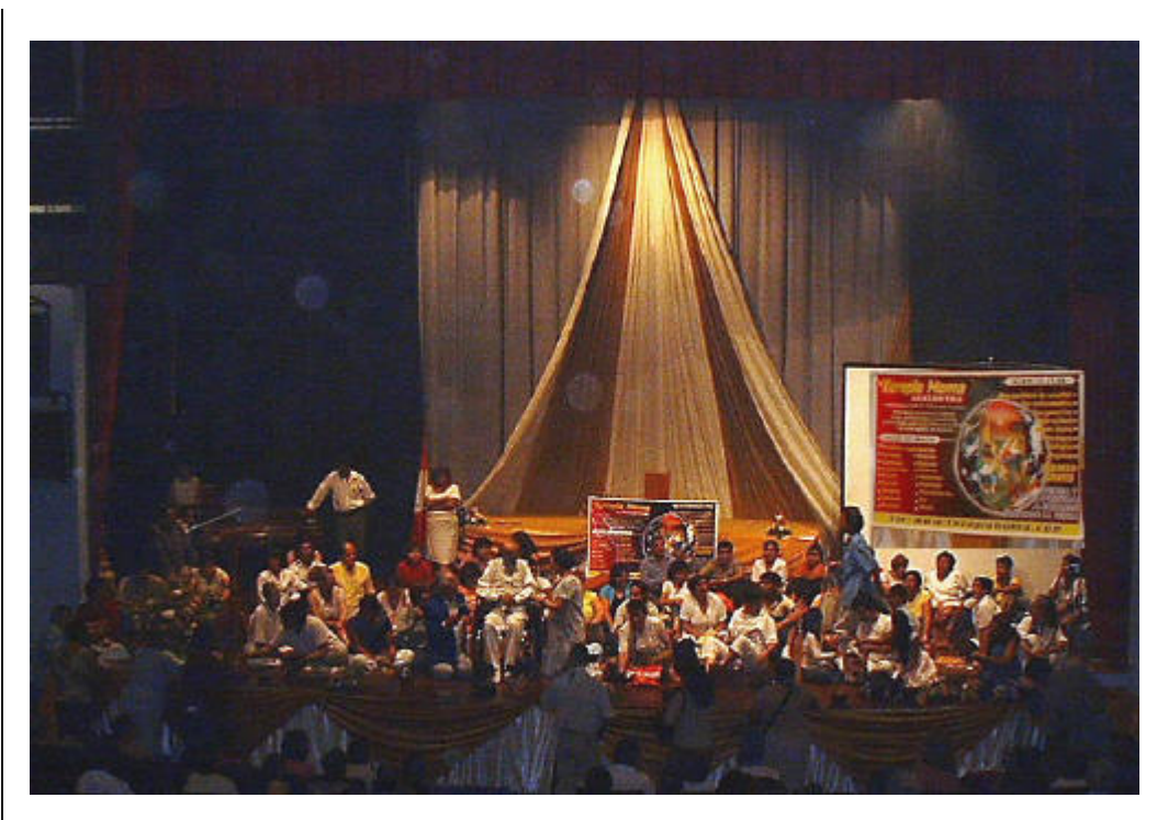
HOMA-Festival in the National University of Piura, Peru where over 140 Agnihotra Pyramids were lit for sunset and over 700 people experienced this "Miracle of LOVE". (Can you see the circles of LIGHT?)

Let us remember that our purpose in life is to learn to be always full of Unconditional Love.