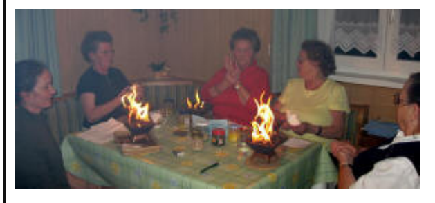
Tschagguns, Austria Agnihotra Evening Fires and Devotional Singing with lots of fun and laughter in the Women's Healing Circle of a wonderful Austrian family.