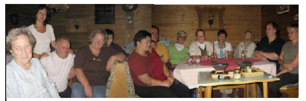
Homa Therapy Presentation in Austria, where many people still have not yet heard about this simple and powerful Healing Technique, but are very interested and in need of it. A lot of work is awaiting the Austrian Homa Teachers.