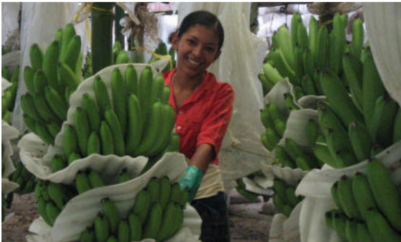
More and better Production with Homa Farming Technology.

Homa Farming Technology in the Hacienda "Fuente de Alegría" ("Source of Joy"), Vinces, Ecuador, South America