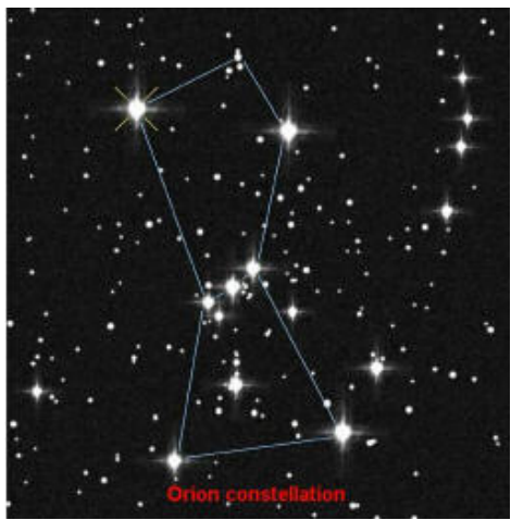
To read further Orion Transmission please see: www.oriontransmissions.com

nearly instantaneous. Such is the effect of this Somayag on human beings' evolutionary processes. Indeed we are witnessing a Yes, yes. When such intense Light is shone reversal in destructive power of the universe. into the atmosphere, darkness rises and What will first appear is chaos, because once seeks to find a way out. It is as if the Light energy is set into motion it must be released exposes the darkness and brings it to the in order to make way for a new cycle of surface to be released. So it is with those growth to take over. So what you are seeing present for the SOMAYAG. The energies played out on the world stage is, in essence, a released into the atmosphere are such releasing of old blocked negative energies. the The powerful impact of this Somayag will Continual fires performed all around the globe will push energies the Naturally, any dark energies a person may Simultaneously, new growth is beginning—