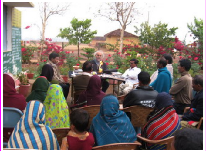
Aheri Village, Dist. Durg District