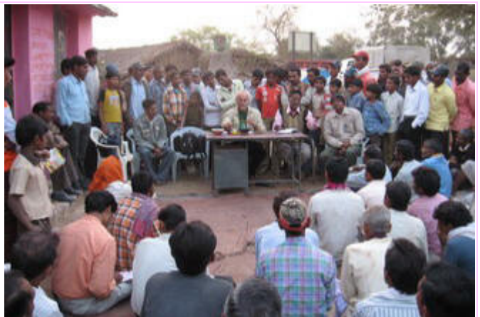
Village Kothar, Dist. Tahsel Kwardha