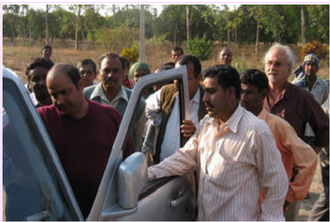
In Mohan Bhata, Bilaspur the speakers of the car were used to hook up the computer to present H.T.