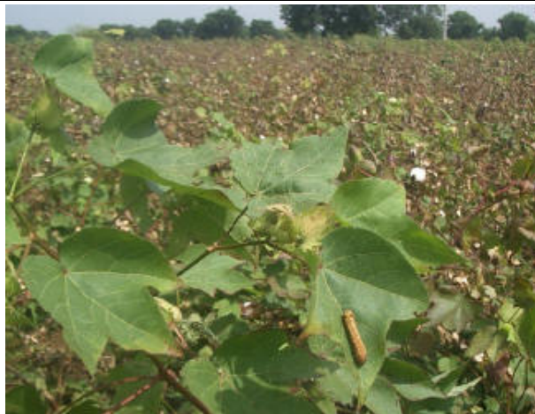
Neighbouring Bt cotton attacked by secondary pests

Tobacco leaf streak virus, tobacco caterpillars, etc, have emerged as new diseases and pests of Bt cotton. The emergence of the mealy bug as a Bt cotton pest also appears to be a case of secondary pest resurgence, and no amount or type of pesticide has been able to control it. This year, the farmers of Khandesh report massive attack of the fungal wilt disease known locally as "Lalya". Lalya seems to attack only some varieties of Bt cotton. Lalya causes an initial reddening of the leaves, then the whole plant turns red and after a few days it completely dries up and dies. In the farms surrounding Tapovan as many as 50% now show signs of Lalya wilt. Some farmers have already removed their cotton and are preparing their land for the next crop. This results in a massive economic loss to the farmers who are already in serious financial difficulty.