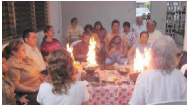
Homa Center, Guayaquil, Ecuador, South America Sunset Agnihotra at the Homa Center in Guayaquil. From Monday through Friday the Homa Center welcomes anybody to learn and experience the Agnihotra fire. Many people receive healings and the Homa Center receives also many blessings through this selfless service.