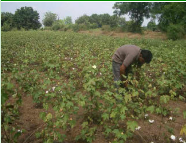
Tapovan Homa cotton- up to 90 bolls per plant

On the other hand in the HOMA Farm "Tapovan" we have sown non Bt American hybrid, Ankur 651. The plants are smaller in height than the Bt varieties but a count of the number of cotton bolls per plant reveals an average of up to 80 or 90. This compares very favourably with the Bt varieties. Bt plants are normally much bigger in size but this does not necessarily translate into more bolls per plant. And on some farms we have counted an average of only 50 to 60 bolls per plant.