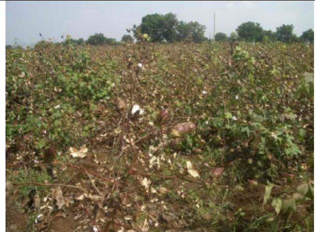
Neighbouring Bt Cotton attacked by "Lalya" disease

On the other hand in the HOMA Farm "Tapovan" we have sown non Bt American hybrid, Ankur 651. The plants are smaller in height than the Bt varieties but a count of the number of cotton bolls per plant reveals an average of up to 80 or 90. This compares very favourably with the Bt varieties. Bt plants are normally much bigger in size but this does not necessarily translate into more bolls per plant. And on some farms we have counted an average of only 50 to 60 bolls per plant.