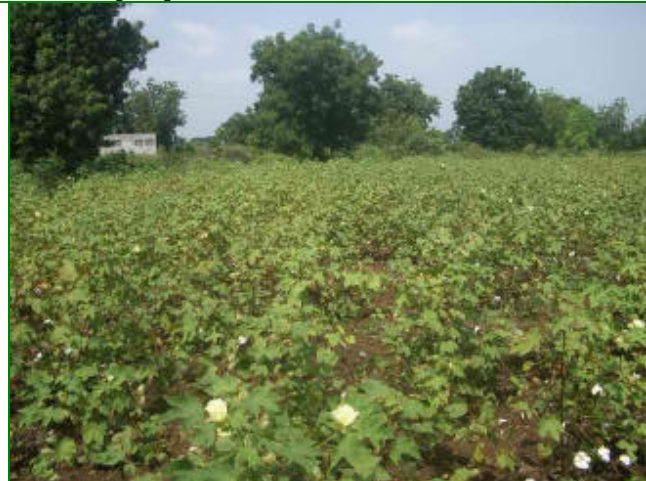
Tapovan Homa Cotton - no pest problems