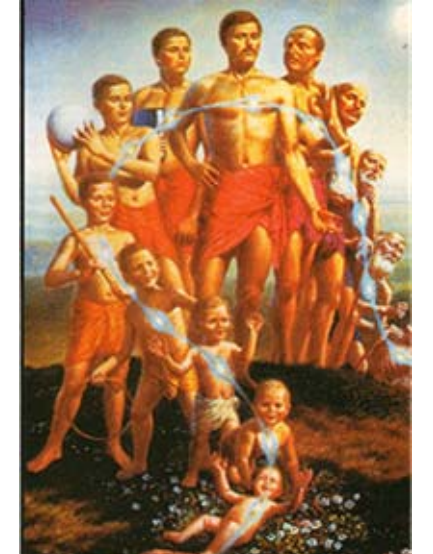
Agnihotra can help to break the CYCLE OF LIFE AND DEATH and bring us back to the Source.

Purport: Be engrossed in the Fivefold Path of Yagnya, Daana, Tapa and Swadhyaya. These are the Eternal Principles of Religion given through the Vedas.