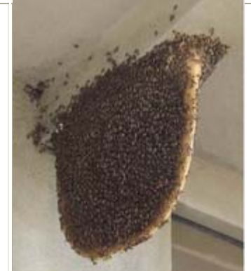
This hive is about 2 feet (60 cm) across.