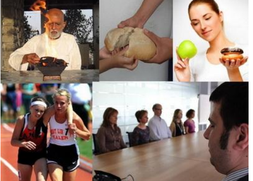
The Fivefold Path contributes to the Peace of the individual.

So it can be taken as the energy released when a certain amount of mass is disintegrated, or the absorbed energy to create the same amount of mass. In both cases. the energy (released or absorbed) is equal to the mass (destroyed or created) multiplied by the